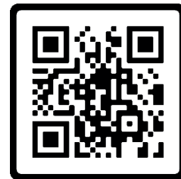
Marmon Valley Alumni page